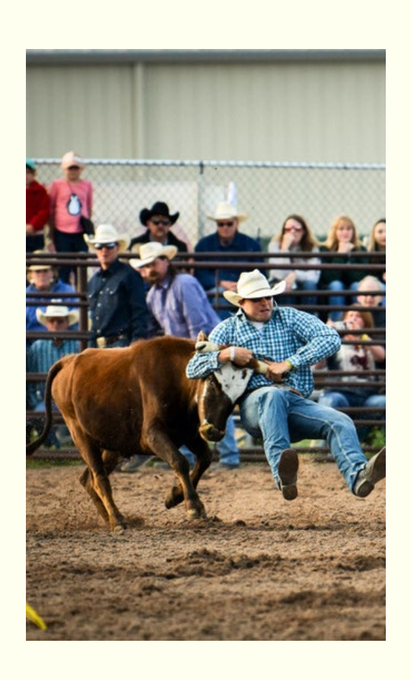
Hell on Wheels Rodeo and Chuck Wagon Dinner