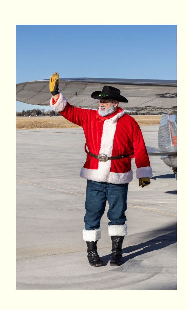
Old West Holiday