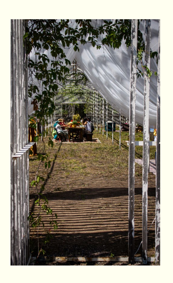
Live Fire and Farm to Table Events