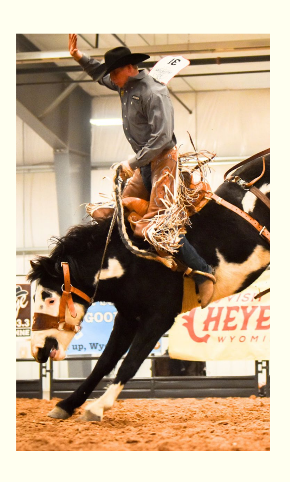
Frozen Fury on the Plains: A Bucking Bronc Futurity Match