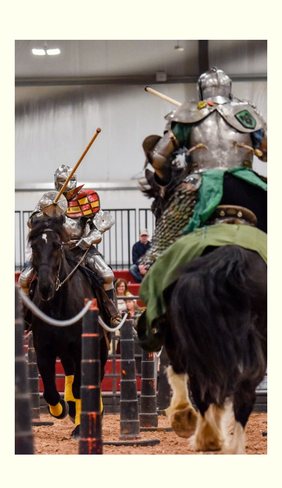
Winter Knights of Cheyenne